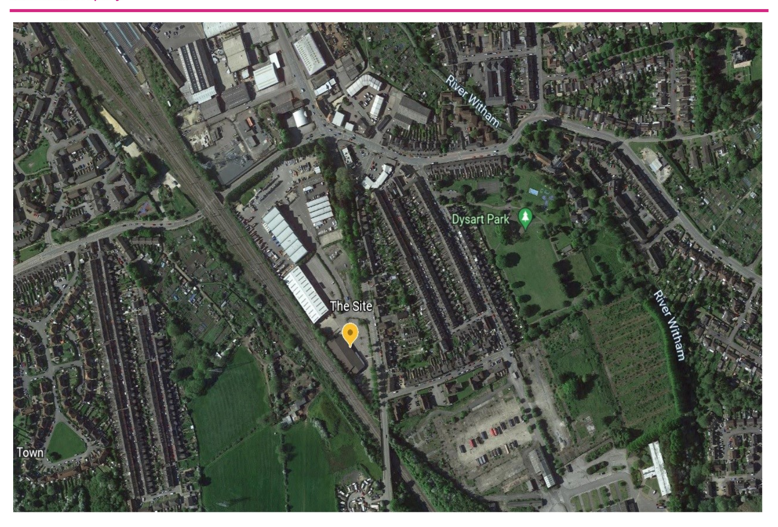
Aerial photograph for illustrative/identification purposes only