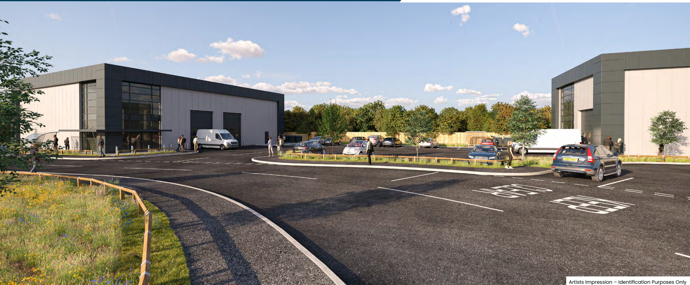
Artists Impression – Identification Purposes Only

Upon the instructions of A&F Forecourts LTD