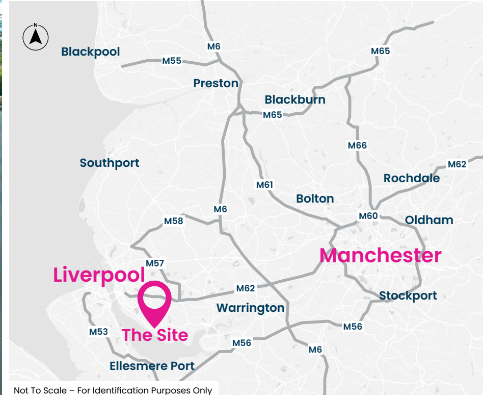
Not To Scale – For Identification Purposes Only