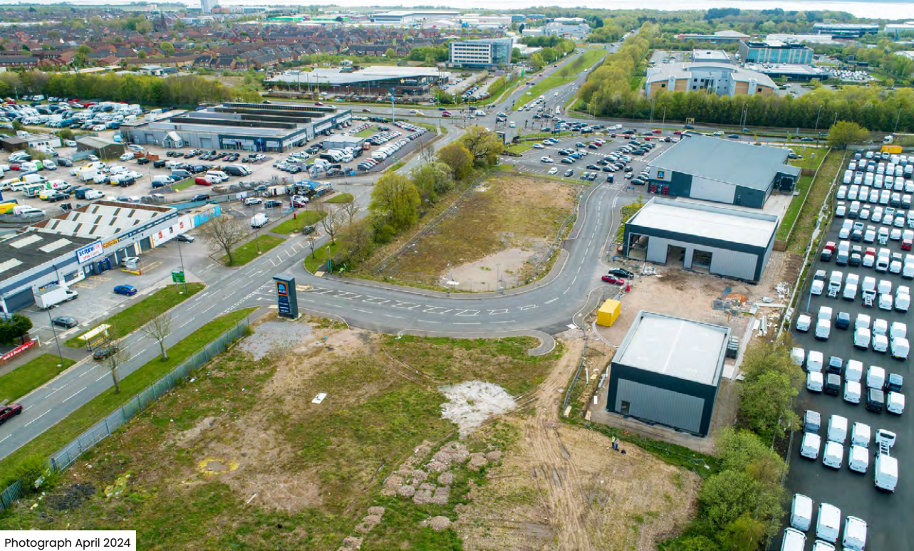
Photograph April 2024