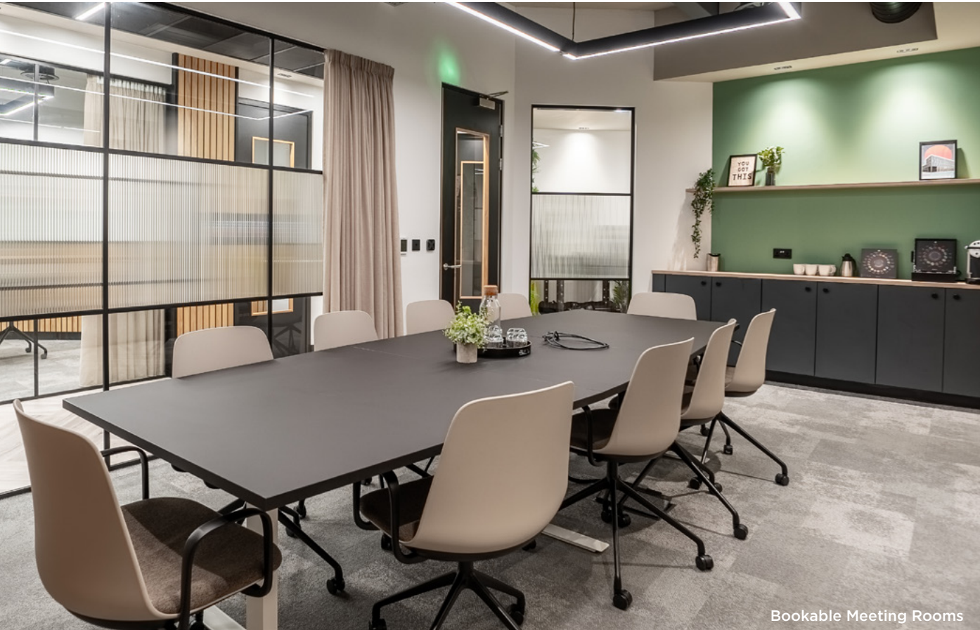
Bookable Meeting Rooms