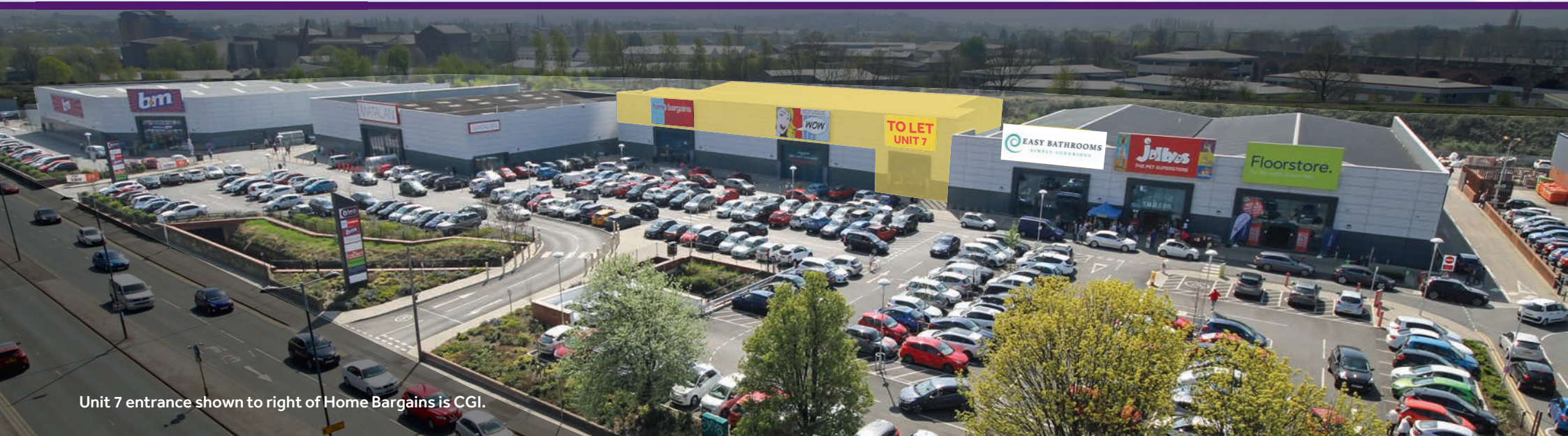
Unit 7 entrance shown to right of Home Bargains is CGI.