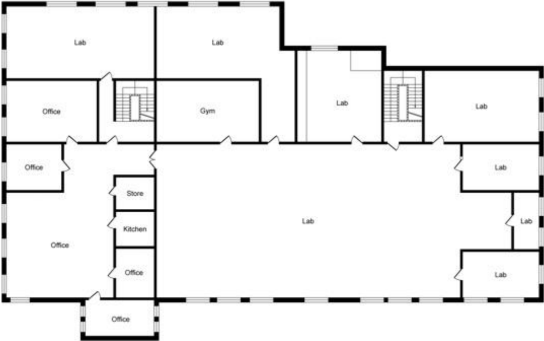
First Floor Approx. Floor Area 6565 Sq Ft (609.9 Sq.M.)