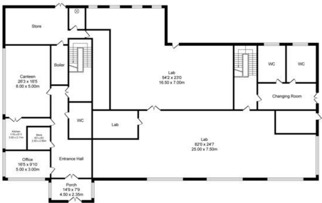
Ground Floor Approx. Floor Area 6471 Sq.Ft (601.2 Sq.M.)